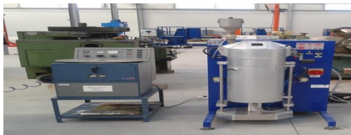
Figure 1. Induterm VD1000 device and Tekcaster Series 100-A device

Induction furnace VC 1000D, which was used during the experiment, is vacuum-pressurized pouring device designed for melting in the electromagnetic induction field under a protective atmosphere. The device allows the melting of the metal in standard conditions, in vacuum or in a controlled atmosphere (N 2 ), and the subsequent casting into a preheated skillet. The melting temperatures can be reached faster with induction heating because the heat is generated directly in the melting material and crucible. Moreover, the metal during melting process is thoroughly mixed by magnetic induction and hence it is possible to achieve homogeneous mixing also when producing the alloys. (Fig.1)