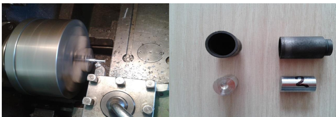
Figure 5. Sample for measuring hydrogen content (H/ppm)

Treated samples were prepared for measuring the hydrogen content on Galileo G8 device. Samples were taken from the inlet and the tip of a sample (A-Inlet, B-Tip of the sample). It was measured under the protective atmosphere of nitrogen ( N_2 ). The sample in a graphite crucible was put into a furnace and melted (heating lasted approximately 30 seconds). Samples were selected based on rotations per minute. Subsequently, the amount of hydrogen was analysed in the units for about 1 minute (ppm- parts per million) which express the low concentration, approximately to a concentration of 1 mg in 1 litre of solution.