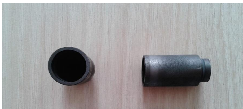
Figure 4 The graphite crucible

The sample is melted in a pulse furnace in a graphite crucible under a stream of inert (main) gas. The graphite crucible, see. (Fig. 4) functions also as a melting element between the two water-cooled electrodes of the pulse furnace. The lower electrode is pneumatically operated and moves up for the closure of the furnace. Freely programmable temperature of the pulse furnace is monitored by a contactless sensor. Temperature can also be controlled by the help of current or power control. [7]