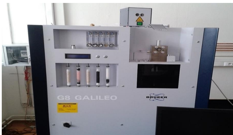
Figure 3 Galileo G8 device for measuring hydrogen content

which is designed for fast and precise analysis of oxygen, nitrogen and hydrogen in the various types of the solid samples, e.g. in steel, non-ferrous metals, aluminium, titanium and its alloys, metals dust, soil, ceramics, glass, cement, and many others. Concentration of oxygen, nitrogen or hydrogen is determined according to a basic gas by a melt extraction with the help of IR detector or TCD (thermal conductivity detection) (Figure 3). [7]