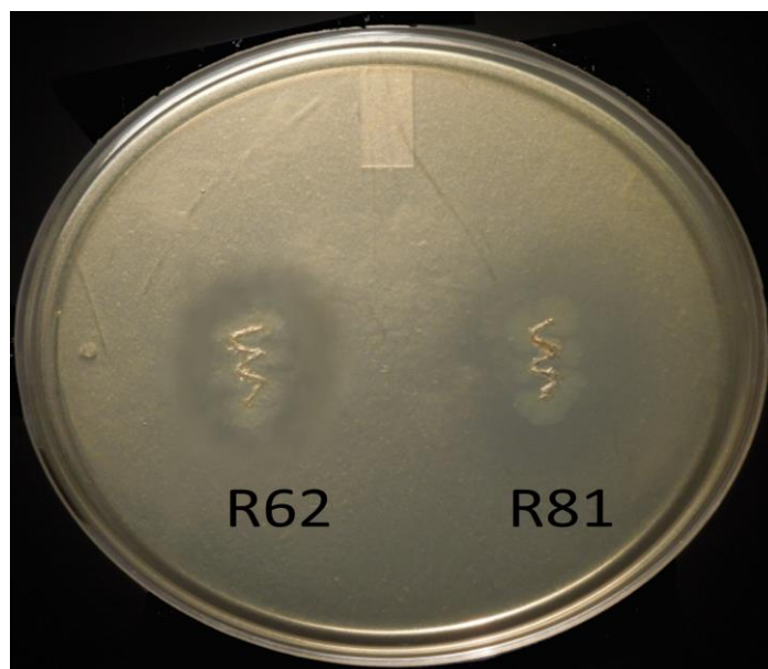
Figure 1. Proteolysis activity of R62 and R81

agar - 20g. The clear zone was observed after 48h of incubation at 28°C. For total enzyme extraction, both the bacterial culture grown in 300 ml of nutrient broth media for 24 h at 28°C. The cultures were agitate with 200 ml of 67 mM phosphate buffer (pH 6.0) consisting of Na 2 HPO 4 ·12H 2 O (2.38 g/L) and KH 2 PO 4 (8.17 g/L). After centrifugation the supernatant was filter sterilized through 0.4mm filter. 5% TCA was added to the filtrate and kept overnight at 4°C. TCA-soluble components were removed by centrifugation at 3400 rpm for 30 min. The TCA insoluble fraction was washed with ethanol by centrifugation at 12,000 rpm for 20 min. The pellet was first resuspended in ethanol and further with diethyl ether and then subjected to centrifugation process. The dried pellet was redissolved in 20 ml of sample buffer for Sodium dodecyl sulfate - polyacrylamide gel electrophoresis (SDS-PAGE) and applied for SDS-PAGE analysis (Laemmli, 1970) using protein marker.